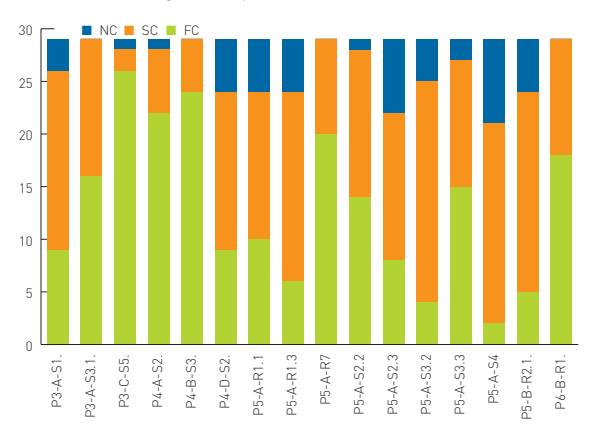
Figure 1. Compliance with monitored OH rules

The highest number of levels SC and NC refers mainly to rules related to bilateral agreements (especially to Policy 5 Emergency Operations).