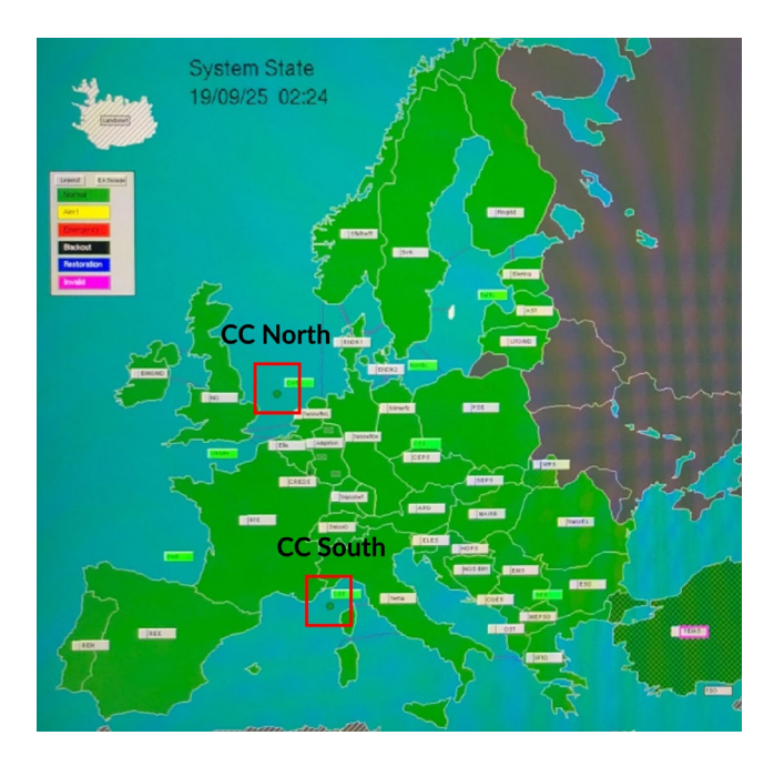
Figure 2: EAS frequency traffic lights with status "green"

All frequency related alarms are centralised in the frequency traffic lights in the North Sea and the Mediterranean as shown below on the EAS System State page.