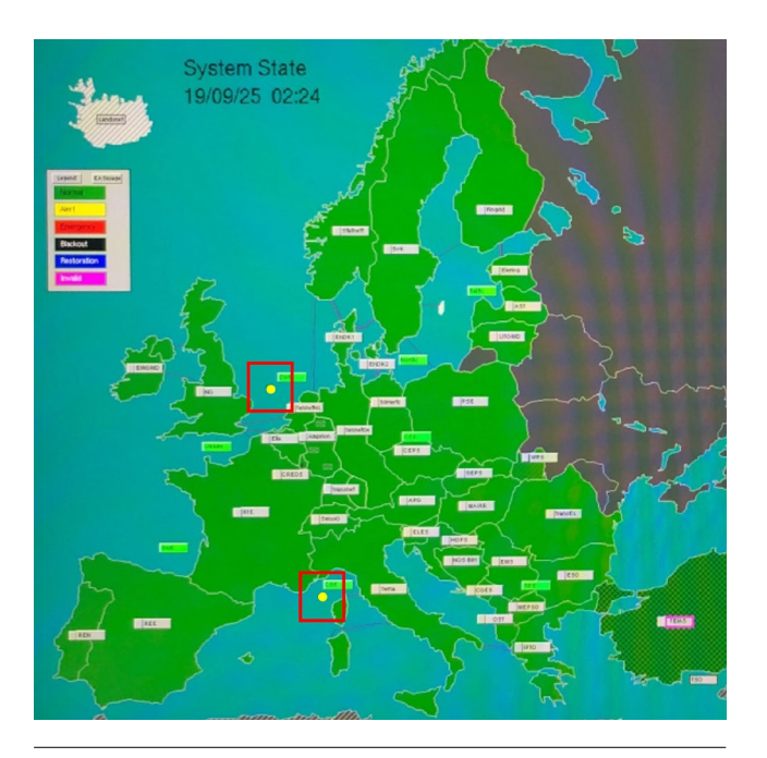
Figure 4 : EAS frequency traffic lights with status "yellow"

If the CCs confirm the presence of an LLFD, the EAS frequency traffic light is set to status "yellow" (Alert).